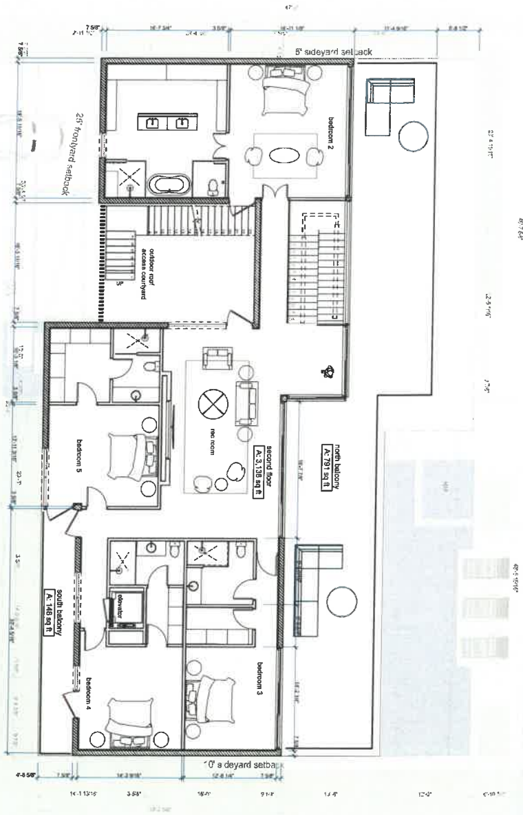
1 Second Floor Plan